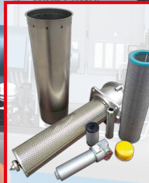
Wind Turbine Filters